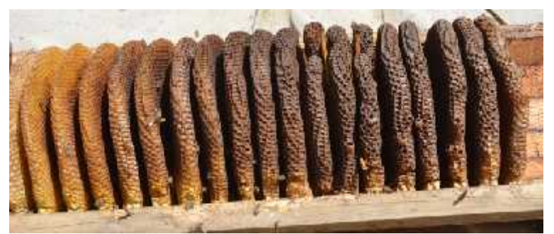
Fig.1 Log hive with fully built combs used for measuring total surface area of combs in a traditional log hive.

The average comb surface area of the race was estimated based on surface areas of combs built in 111 different log hives. For each hive the comb surface areas were calculated by taking the average comb radius then multiplyingby the number of combs built by the colonies. The numbers of combs were counted after the colonies were transferred from log hives into box hives for other research purposes (Fig.1).