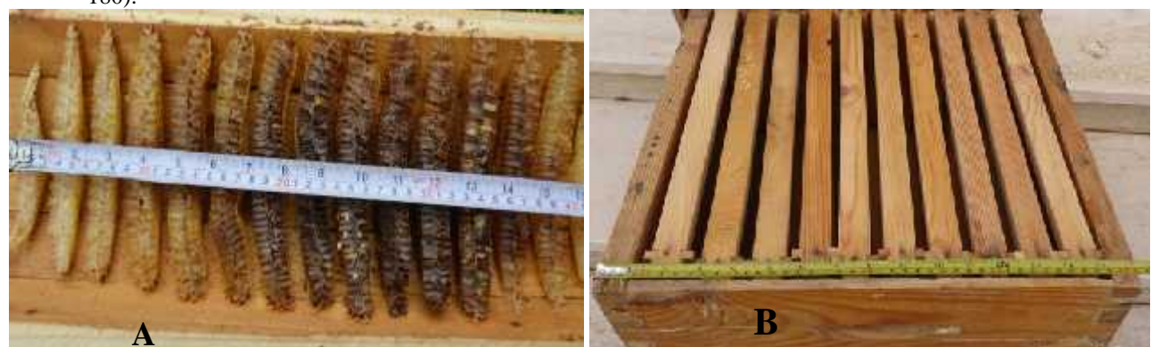
Fig. 3 The average number of combs (14) built per 40cm length in log hive (A), which is the same length used to keep only 10 frame combs in box hive (B).